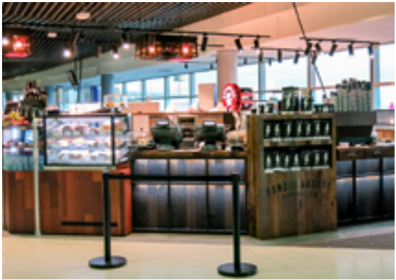
This open plan café features a food preparation area and full seating with feature lighting and the use of contrasting materials to create a warm industrial finish.

Since 2002, AC Fitouts has established a track record of successful fitout projects for happy clients across South East Queensland and beyond.