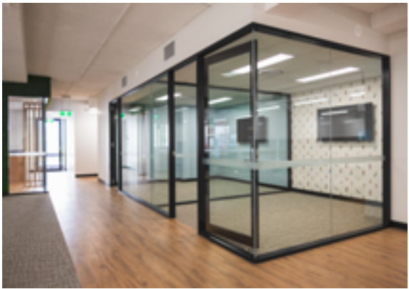
From an empty shell, this space was transformed to encompass the company's culture, energy and creativity. The fitout includes bright, open spaces which still allow for private meeting rooms. The kitchen featured sparkling water and beer on tap.