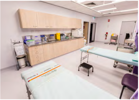
Medical Fitouts require specialist expertise. Our team of shopfitters are experienced at delivering the front and back of house areas for a wide variety of medical and dental clinics and allied health facilities.